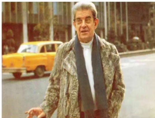
Jacques Lacan (1901 -1981)