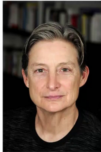
Judith Butler (Born. 1956)