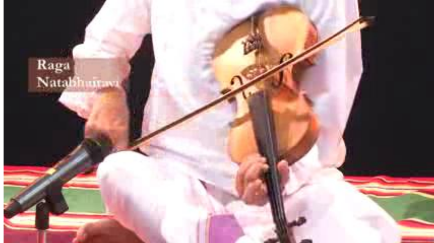
(Refer Slide Time: 07:27)