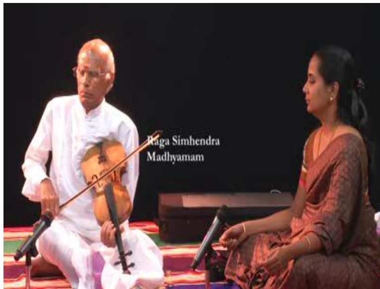
(Refer Slide Time: 09:29)